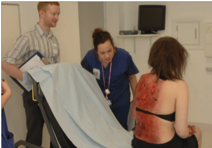
Figure 1 - simulated burn for assessment

'Mersey Burns' (MB) is an application (app) for use on smartphones and tablets designed to improve assessment and fluid resuscitation following burn injury. The app allows clinicians to shade the burn pattern onto the screen in real time, and then generate detailed fluid protocols as well