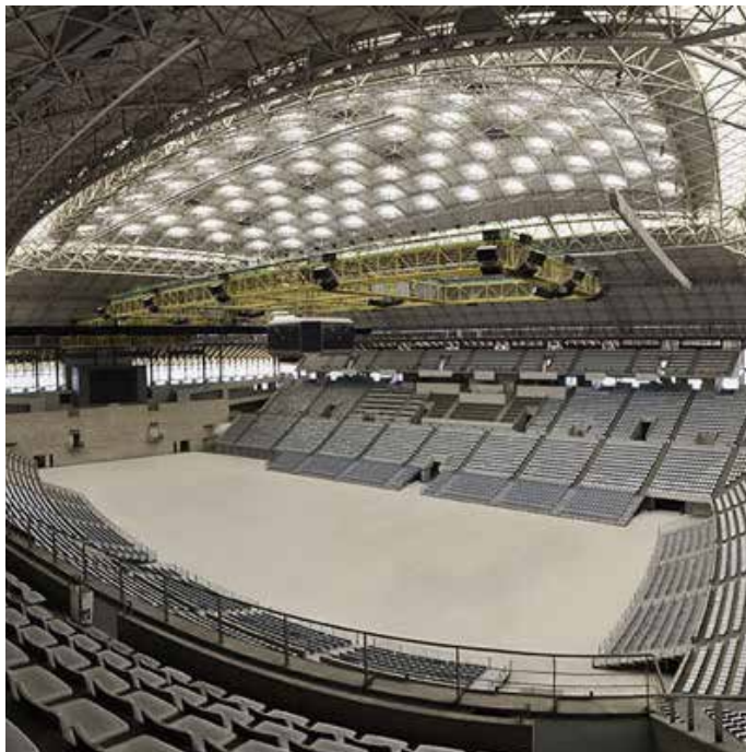
Figure 3 – Interior view of Palau Sant Jordi and structural sensor map