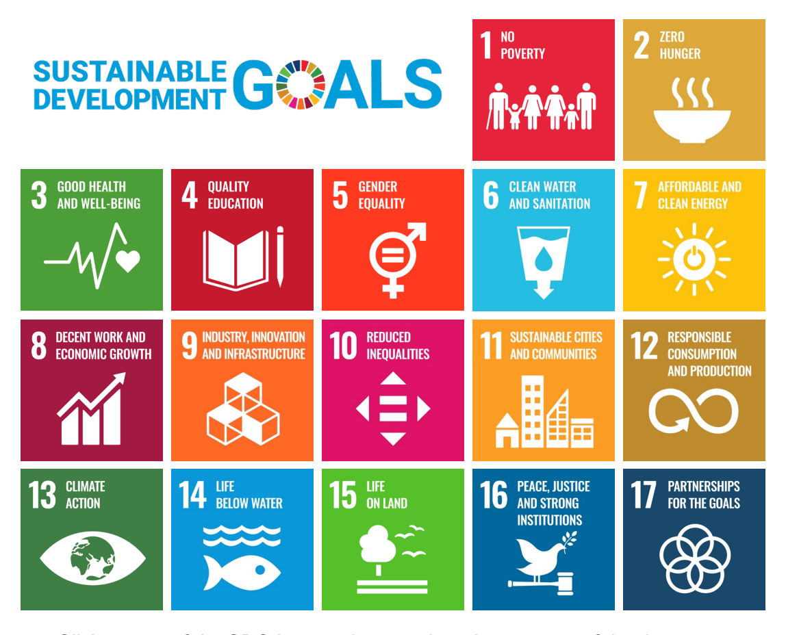
Click on any of the SDG icons to jump to the relevant page of the document.

This guide was created by the IET Inspec team for use as a resource in identifying Subject Classifications within Inspec that may contain content relevant to the 17 Sustainable Development Goals (SDG).